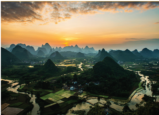
Five Finger Montains

The province has 154 rivers flowing into the sea, the top three of which are the Nandu River, the Changhua River and the Wanquan River. Mostly the coasts are accumulated from eroded volcano basalt in the terraces, evolved from low vale to small bay or accumulated coasts, and layered coasts formed by sand banks. Its coastlines is 1528 kilometers long with sandy beaches. Tropical mangrove and coral reef coasts feature the coastal ecosystem.